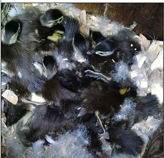
Wood Duck hatchlings in nest box.

The Huntley Meadows Monday Morning Birdwalks this spring have been extraordinary. In May alone, records for species heard and/or seen and number of birders were broken. The number of migratory species broke long standing records for the Monday Morning Birdwalk. On May 2, the group tallied 85